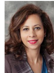
Karenne Levy MacDonald Training Center