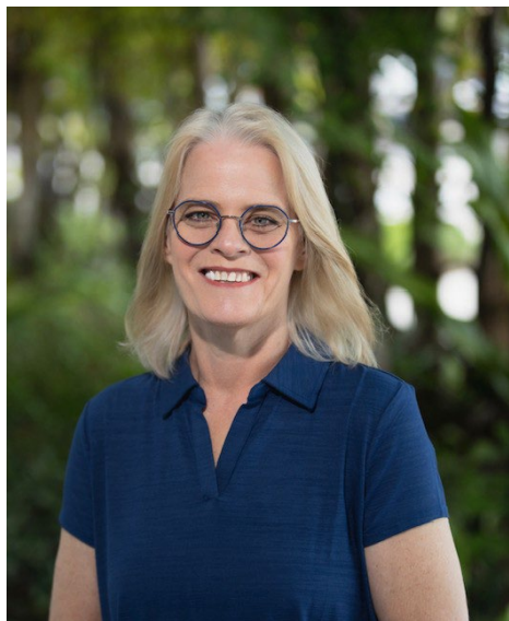
President/CEO Arc Broward

“Florida ARF membership is more than a professional affiliation - it’s a strategic partnership that amplifies our collective voice and strengthens our impact. As a long-time member, I’ve seen firsthand how the Association brings providers together to navigate challenges, shape policy, and drive innovation in services for individuals with intellectual and developmental disabilities. The access to timely information, advocacy expertise, peer collaboration, and training resources is unmatched. More than anything, Florida ARF connects you to a committed network of providers who share your mission and values. Together, we are stronger, more informed, and better equipped to create inclusive, person-centered communities across Florida.”