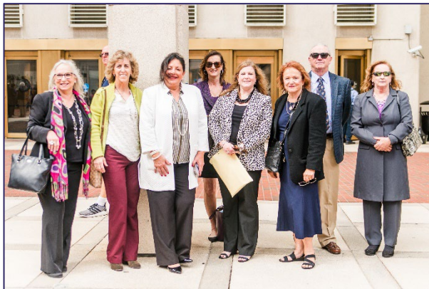
DD Day at the Capitol