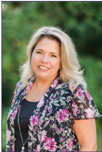
Director of Finance & Accounting