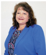
Melissa Walker Key Training Center